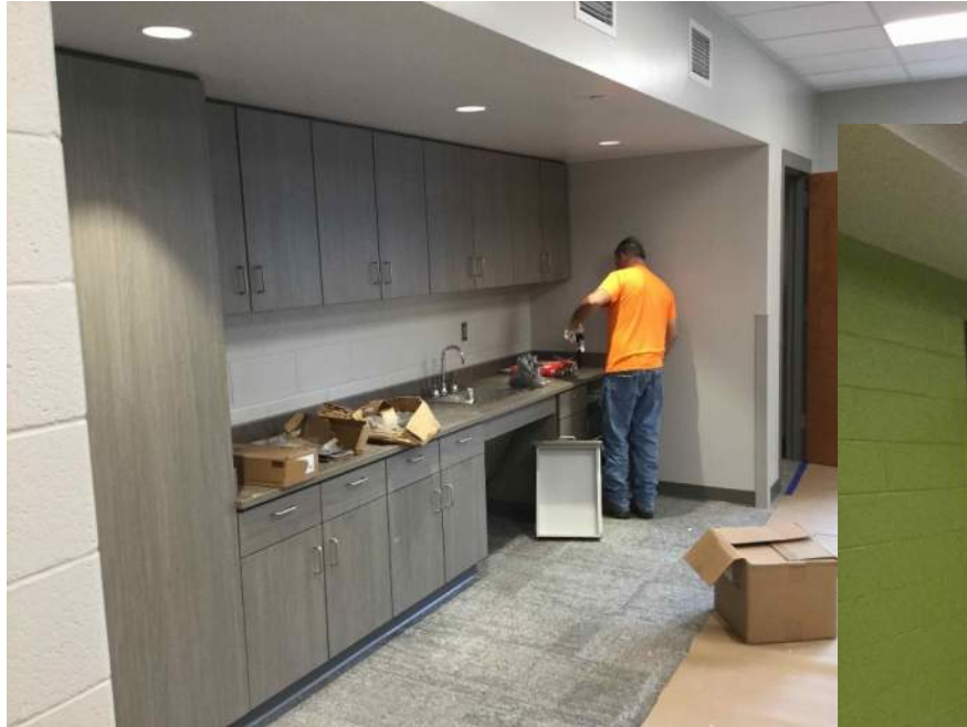
Classroom - Casework