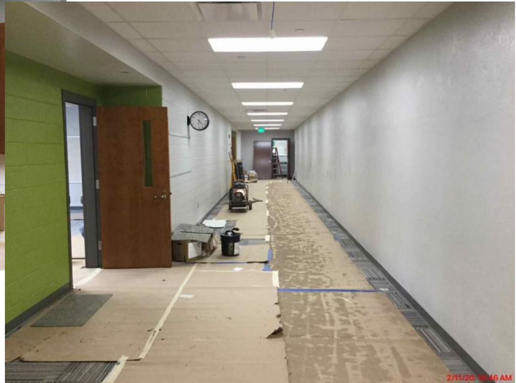
1 st Floor Corridor