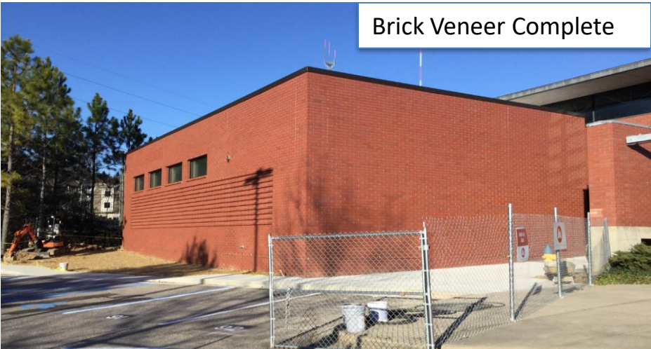
Brick Veneer Complete