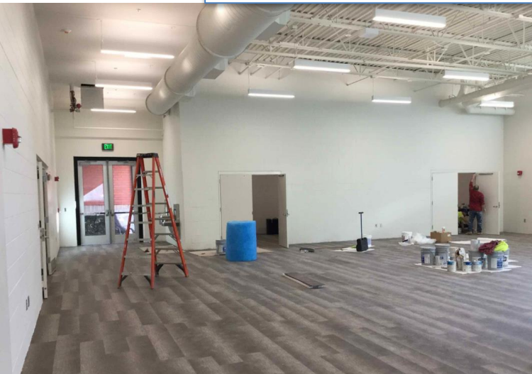
Interior Multipurpose Room